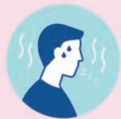
Chills and Fatigue

If you're experiencing symptoms and have traveled to areas of concern (or have been in contact with someone who has), please call the nurse triage number before you come into the office. Arrange for special transportation to and from your medical appointment. Do not use public transportation. Symptoms of Covid-19 are like the cold or flu and may take up to 5-14 days to appear after exposure to the virus. Be vigilant as severe cases may lead to pneumonia, kidney failure, or death.