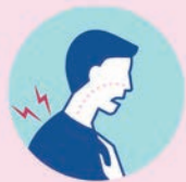
Muscle Pain and Weakness